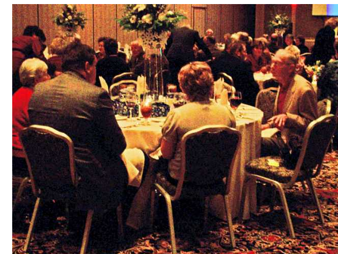
Guests enjoy good food and great company at the OCCF annual meeting and donor appreciation dinner, held December 9 at the French Lick Resort.